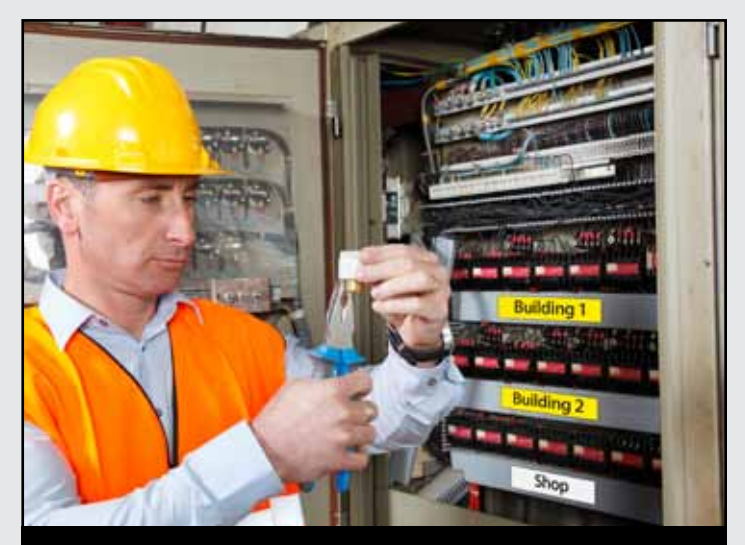
K-Sun magnet tape is durable under a wide variety of harsh conditions.

Store your magnet tape in a clean dry place, at 70°F (21°C) and 40% to 50% relative humidity.