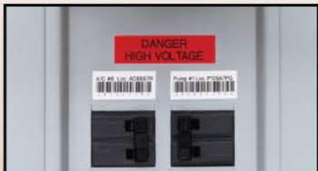
Panel and warning labels

Ideal for rough, irregular surfaces - our Cast Vinyl is tough and flexible. Cast Vinyl has excellent conformability making it great for curved surfaces and marking pipes.