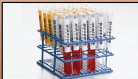
Laboratory and hospital